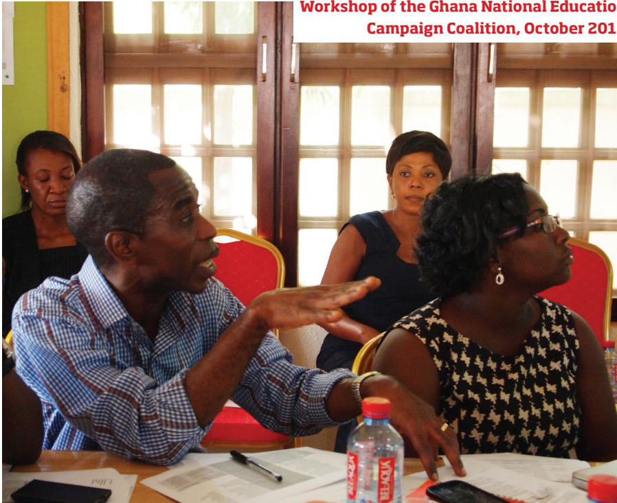
Workshop of the Ghana National Education Campaign Coalition, October 2014