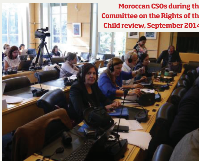
Moroccan CSOs during the Committee on the Rights of the Child review, September 2014.

The cycle begins with the submission by the State of its report on how it respects, protects and fulfils the particular treaty to the Office of the United Nations High Commissioner for Human Rights (OHCHR) or the regional human rights body. On the basis of this report the Committee prepares a list of questions, called “list of issues”, requesting more information from the State. The government is invited to provide written responses to the list. Next, a public dialogue between committee members and representatives of the government takes place. On the basis of that exchange, the Committee adopts so-called concluding observations and makes recommendations on action to be taken by the State. Following this process, a next important step is the follow-up of the implementation